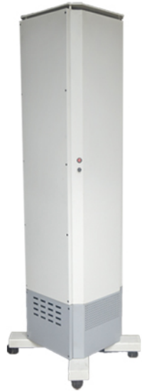
YUVI Steriair 1