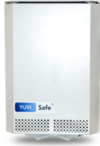
YUVI Steriair 2